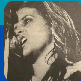
LISA MARIE PRESLEY